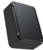
Smooth Face Cover Option