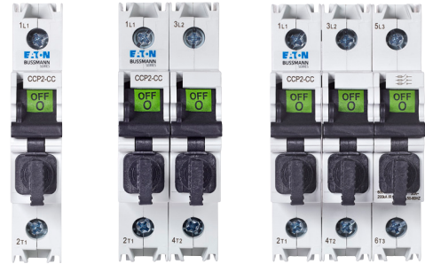
1-, 2-, and 3-pole CCP2-30CC

See CCP2-CC data sheet no. 10789 for complete technical information.