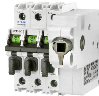
3-pole CCP shown with right front through-the-door rotary operator (CCP2R-3-30CC).

* For fuse performance under or above 25°C, consult fuse performance charts in Eaton's Bussmann series Selecting Protective Devices (SPD) handbook (Pub. no. 3002).