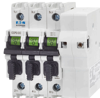
3-pole CCP shown with right side through-the-door rotary operator (CCP2S-3-30CC).