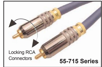
Locking RCA Connectors

Custom Lengths Available, please ask your sales representative